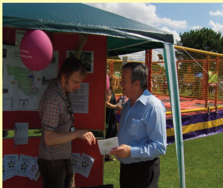
Pictures taken from Issues and Options Consultation Events