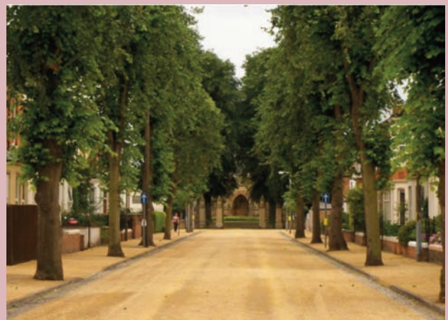
Completed restoration work 2009