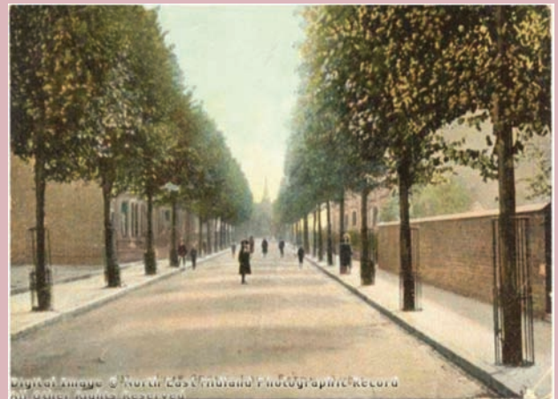
Lime Grove c1900

To find out more about the Townscape Heritage Initiative visit the website at www.longeatonthi.com